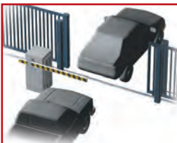
automatic p.a.m.s. sequencing with slide and swing gates