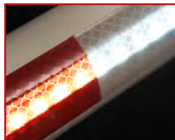
lighted arms for added visibility and safety