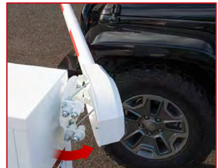
breakaway arm option reduce maintenance costs