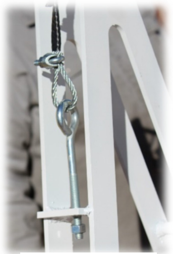
Use 9/16" socket to turn bolt, this will tighten the cable and straighten the arm