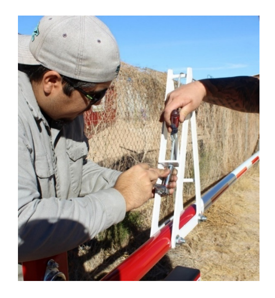
Have someone hold a screw driver through the eye bolt as pictured while you tighten the cable. This will ensure you don't pinch your fingers while tightening the cable