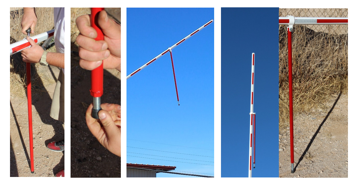
The pendulum supports are powder coated white. Shown above in red for clarity.

If you purchased a unit that includes a Cable Truss Support go to page 6 & 7 before installing this pendulum support post. You will need to install the cable clamp bracket before the pendulum support.