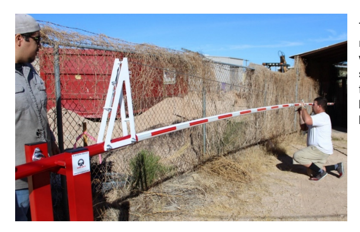
The arm will have a bend or sag before you tighten the cable. This is normal and you will see as you turn the bolt with the socket or wrench the cable gets more taught and the arm will begin to straighten. Once you are satisfied with the tightness of the cable and the arm is straight, stop. Over tightening will give you an upward bow. If that happens loosen the bolt until arm is straight and not bowed upward.