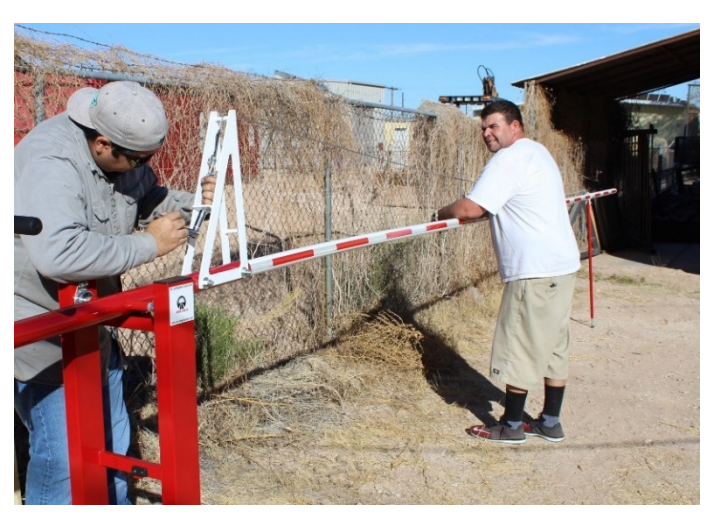
Installation Trick: Have someone press down gently on the top of the arm like this while you are tightening the cable: This will take the sag out while you are tightening and will make it easier to turn the eye bolt. Be sure to have the pendulum support installed for this install trick as shown in picture to the left.