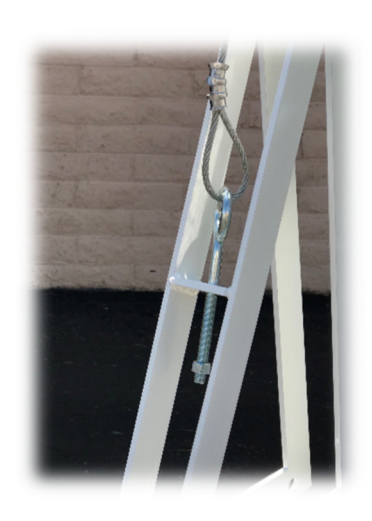
Use 9/16" socket to turn bolt, this will tighten the cable and straighten the arm