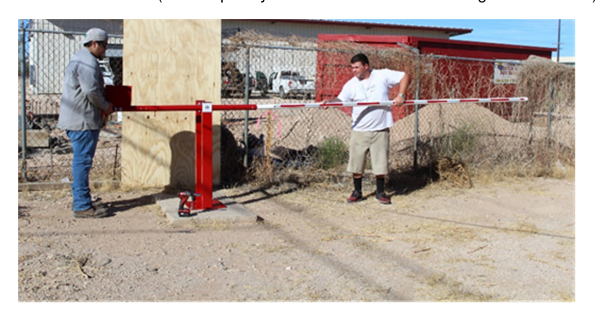
Step 7: Secure with the provided bolts and washers and tighten. Use a 3/4" socket.

Step 6: Insert the white/reflective striped barrier arm section with the two holes into the red receiver tube on base unit. (See Step 8 if your unit has a barrier arm longer than 12 feet).