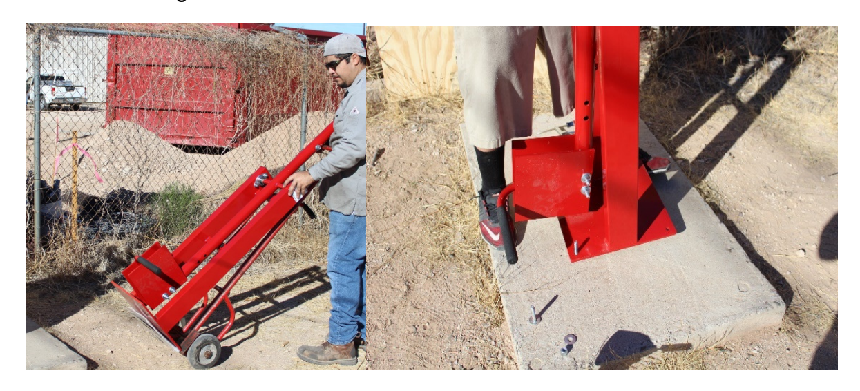
Step 3: Remove the bolt and nut that is holding the unit in the upright shipping position, set bolt and nut aside, you will need it later in the installation process. Use a 9/16" socket.

Step 2: Bolt base unit to the concrete or concrete pad. Anchor Bolts are not included. Purchase ½" diameter and 6" to 8" long.